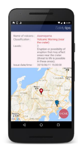
Visualizes area of disasters and current location